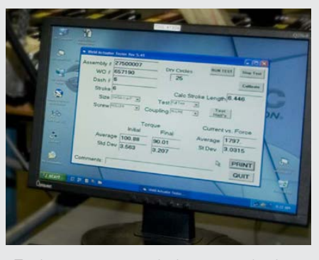
Testing parameter results in progress for the Functional Test procedure.

Properly applied, every new and remanufactured ServoWeld actuator shipped will provide millions of cycles of maintenance free performance.