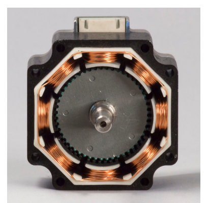
Figure 1: The many teeth inside a stepper motor.

The stepper motor's position is known by the number of input pulses or steps commanded. A common stepper motor can have 1.8 degrees mechanically per step, which results in 200 steps per revolution.Manufacturers will spec a step angle accuracy of 3 to 5 percent of one step noncumulative in a typical stepper motor.