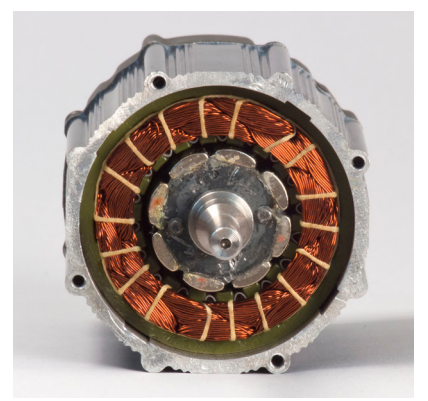
Servo motors are driven using control loops that must be tuned per application.

BLDC servo motors maintain relatively constant torque throughout the speed range.